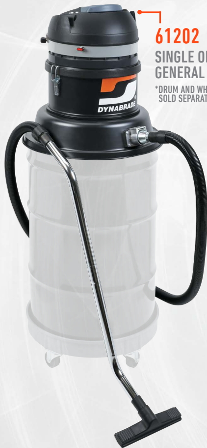
61202 SINGLE OPERATOR GENERAL PURPOSE *DRUM AND WHEELED BASE SOLD SEPARATELY