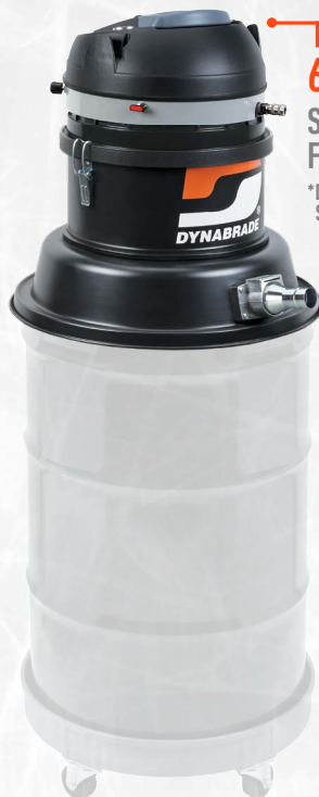
61203 SINGLE OPERATOR FOR USE WITH TOOLS *DRUM AND WHEELED BASE SOLD SEPARATELY