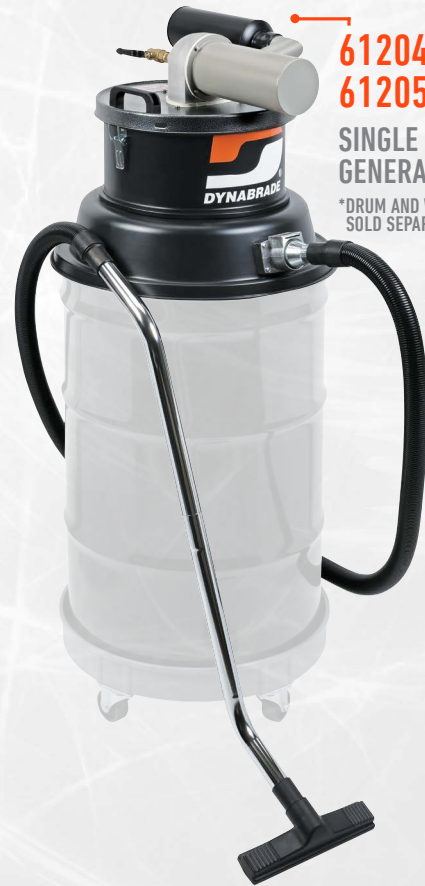
61204 - DRY 61205 - WET SINGLE OPERATOR GENERAL PURPOSE *DRUM AND WHEELED BASE SOLD SEPARATELY